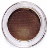
Laura Mercier Brow Definer. If your hair is fine, a gel-cream like this adds thickness.