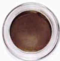
Laura Mercier Brow Definer. If your hair is fine, a gel-cream like this adds thickness.