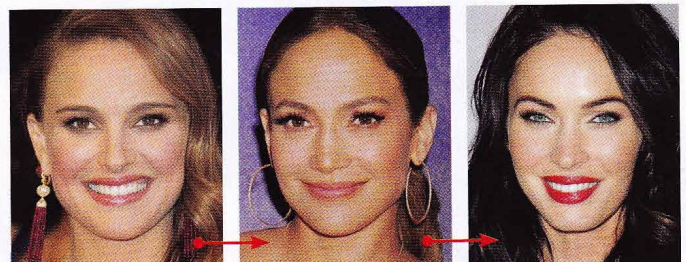
LOW ARCH Natalie Portman