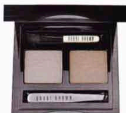
Bobbi Brown Brow Kit in Dark. When in doubt, choose taupe, which creates a natural-looking shadow for most blonde and brunette brows.