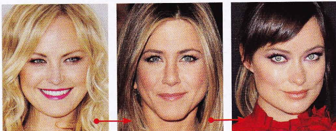
LOW ARCH Malin Akerman