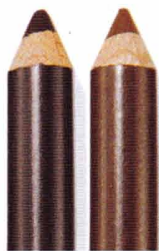
L'Oréal Paris Brow Stylist. Low-oil pencils like these won't settle into pores or smear.