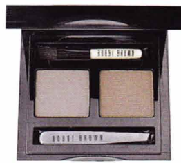
Bobbi Brown Brow Kit in Dark. When in doubt, choose taupe, which creates a natural-looking shadow for most blonde and brunette brows.