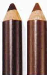
L'Oréal Paris Brow Stylist. Low-oil pencils like these won't settle into pores or smear.